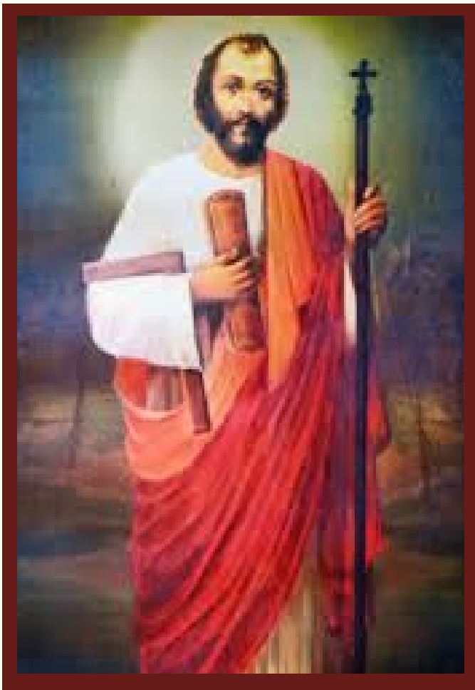
St, Thomas the Apostle