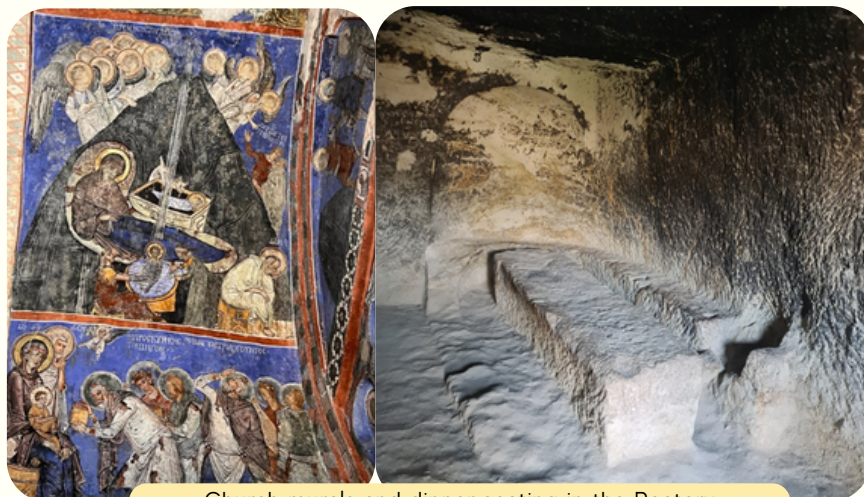
Church murals and dinner seating in the Rectory

We then had a scenic ride through the mountains and reached Ankara, visited the Mausoleum of Ataturk locally called Anitkabir, the final resting place of the founding father of Republic of Turkey and witnessed the impressive change of guards ceremony and the walkway into the distance and the impressive Ankara city view from the top of the hill. The President's residence called the Cankaya Mansion which we passed by is a huge complex of buildings and has 1,150 rooms!