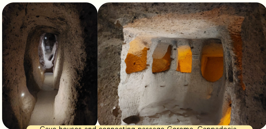
Cave houses and connecting passage Goreme, Cappadocia

Goreme was a Byzantine Monastic settlement. There are several churches in this settlement on the higher grounds, having frescoes on their walls and roofs depicting scenes and stories from the New Testament. Many churches had 3 altars front face indicating the Triune God belief they held. There are long tables and seating arrangements made in the adjoining room carved out of the rock for dining, perhaps the rectory.